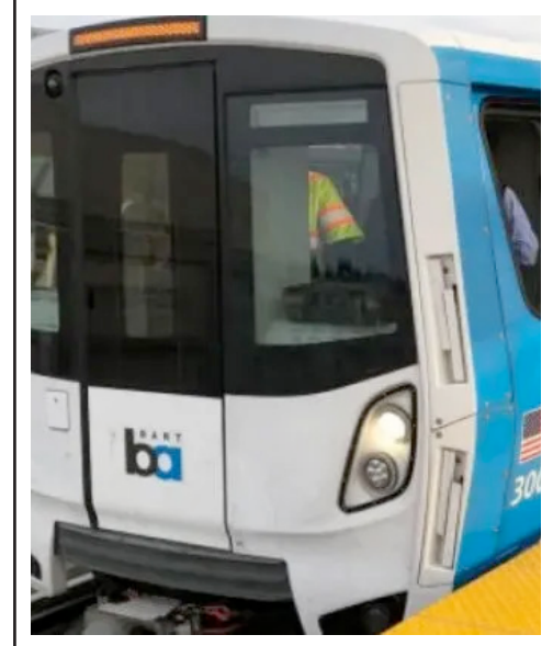
[Article originally appeared in www.seamlessbayarea.org ]

The SB125 Transit Transformation Task Force - charged by the state legislature with studying the costs to operate and maintain public transportation over the next ten years and making recommendations regarding how to improve mobility and increase ridership on transit - hosted their inaugural meeting on December 19th. The task force includes 25 members, with representation from transit agencies, labor, business, academics, and nonprofits, as well as key staffers from the state administration and legislature.